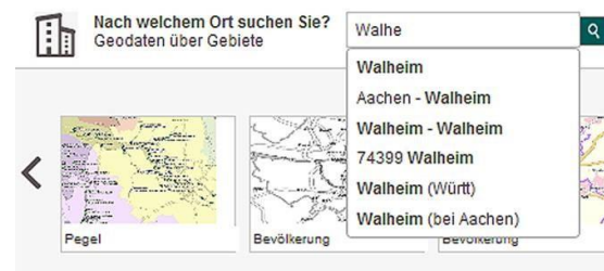
Figure 3-3 The search utility within the Geoportal.DE – live suggest during user input

The 'Georeferenced Address Data Federation' dataset mainly consists of data from the 'Association for the Distribution of House Coordinates' run by the surveying authorities of the Länder. After processing, this dataset provides point coordinates for house addresses and encircling bounding boxes of streets, places and zip codes. The search utility implements two search strategies: a high performance live suggest search, i.e. to deliver real time suggestions for search terms and/or other relevant information based on live user input in an application, on the one hand, and a fault-tolerant search on the other. Words matching the search term are highlighted. While in the results of the live suggest search only the elements' name as part of the address are shown, the fault-tolerant search provides the complete dataset including geometry. If the match between search term(s) and results is weak, a list of similar places or addresses is offered. The search utility is able to handle unstructured input of addresses.